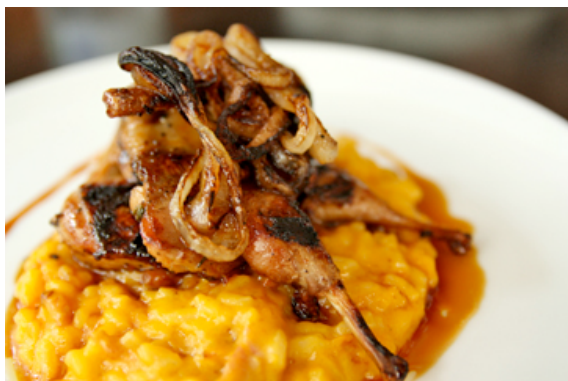
For the bird: Maple glazed quail is reason alone to visit Reds—but it was just the beginning

A $35 table d'hôte makes one of Bay Street's priciest—and most delicious—lunch spots accessible to those without an expense account By Renee Suen